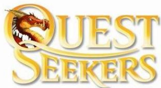
The Summer Reading Challenge in libraries

We would like to take the opportunity to congratulate all children who took part in the Public Library's Quest Seekers Challenge and invite them to show their medals in assembly on Friday 18th September.